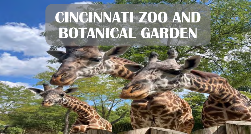
CINCINNATI ZOO AND BOTANICAL GARDEN