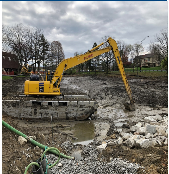
Dredging work underway in Washington Township

The two Clean Ohio grants total $1,339,516 and will cover 75% of the anticipated cost of the project, ensuring that the RecPlex and Washington Township continue to be strong financial stewards of taxpayer funds by continuously looking for ways to offset the costs of projects through grant funding.