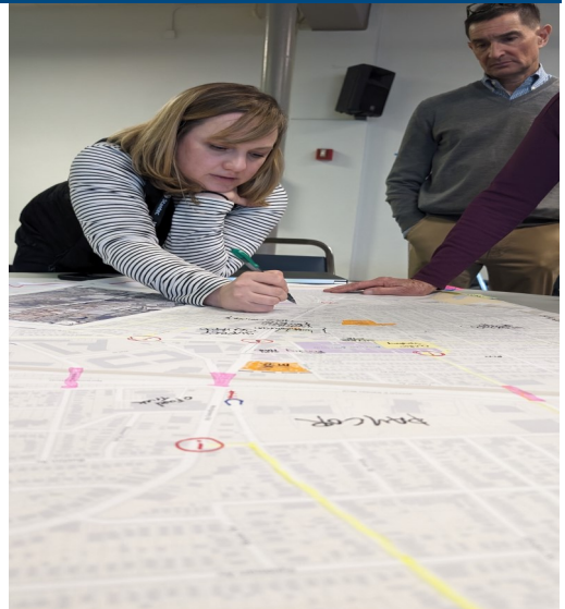
People look at plans as part of Norwood's CNU Project

Registration is open to non-CNU members. Click HERE to learn more and to register. Early Bird registration has been extended to Friday, April 5, 2024. Also, please check out the recent WVXU article on Norwood's CNU Legacy Project: Cincinnati Edition on Norwood's Legacy Project .