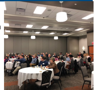
The 2018 Newly Elected Officials Training

This training will be open to any Center for Local Government member, any government from Hamilton County, plus member governments of the Miami Valley Risk Management Association or Miami Valley Communications Council. Please keep an eye out, as an official invitation and RSVP information will be out soon! You will find more details about this and our other training offerings on the CLG website events page.