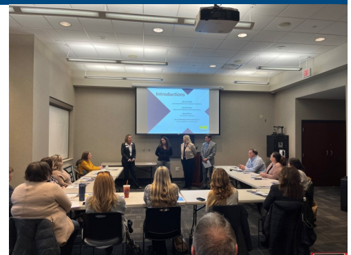
Xavier University held an Info Session on the Employee Discount Program on January 8th.