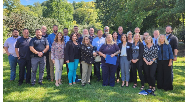
The 2023 CLG Leadership Academy Class

Thank you again to all who attended. We hope to see you soon.